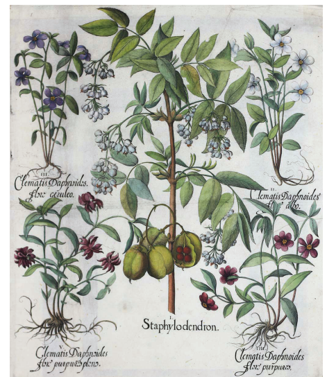
Staphylo dendron , 1613, Basil Besler (German, 1561–1629). Hand-colored copperplate engraving, from Hortus Eystettensis ( Garden of Eichstätt ), Nuremberg, first edition, Gift of Jeffery M. Leving, 2017.2.2.

The final work in the gift is a mid-18th century engraving by N. F. Eisenberger after Elizabeth Blackwell, from the German edition of her groundbreaking work A Curious Herbal , originally published in London, 1737–39. Blackwell (British, c. 1707–74) was the artist and engraver for the publication. The Curious Herbal was acclaimed for its detailed and accurate illustrations of many newly discovered plants and its contribution to medical knowledge. It is one of the earliest botanical books compiled by a woman, and Blackwell was one of the first women to achieve fame as a natural history illustrator.