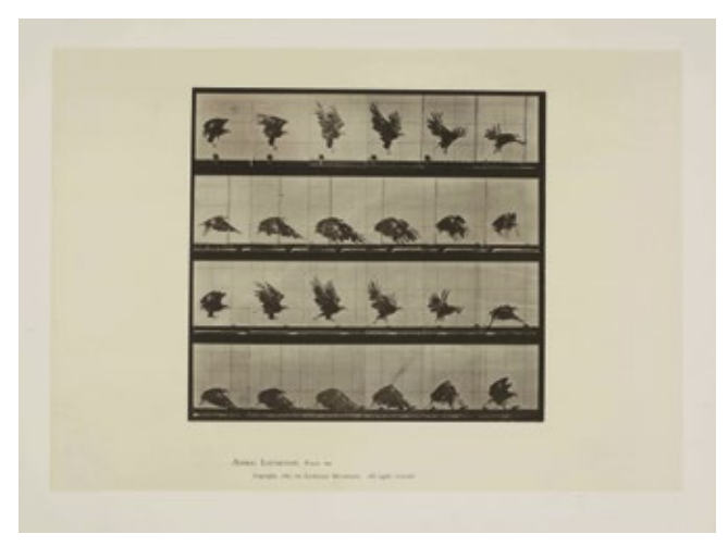
(American eagle; flying near ground), 1887, Eadweard Muybridge, plate number 770 from Animal Locomotion series, museum purchase with the Rynning Museum Fund, 2017.2.4.

The photograph was purchased in honor of the museum's upcoming 2019–20 exhibition, Science in Motion: The Photographic Studies of Eadweard Muybridge , Harold Edgerton , and Berenice Abbott . The exhibition, which comes to the museum from Bank of America, offers a rich and extensive view of the scientific studies done by three of photography's greats. Though Edgerton, Muybridge, and Abbott arrived at the nexus of photography and science in different ways, they revealed to us that which was previously unseen.