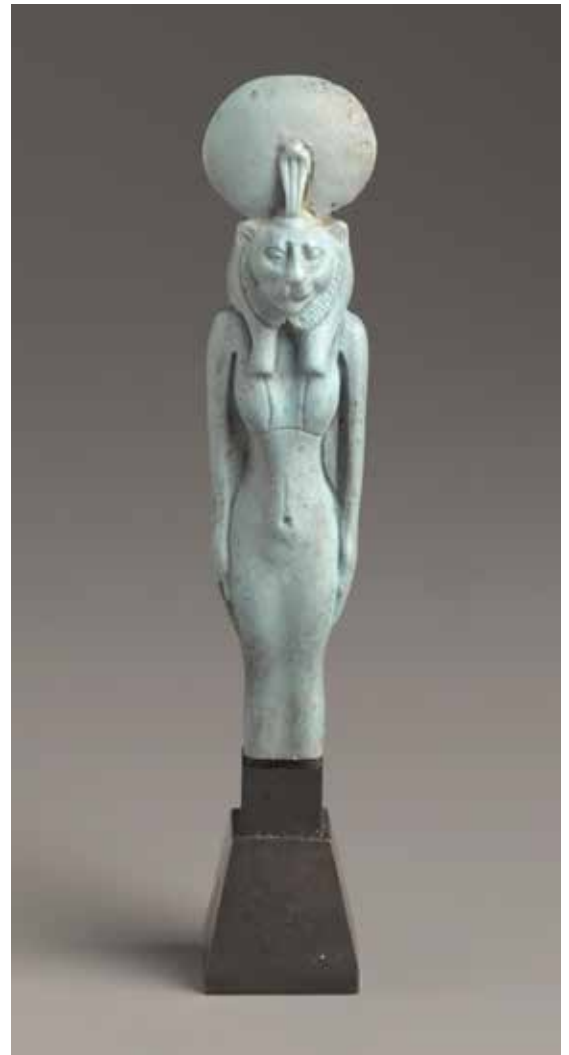
Figurine of a Standing Lion-Headed Goddess, Faience, Brooklyn Museum. Charles Edwin Wilbour Fund, 37.943E.