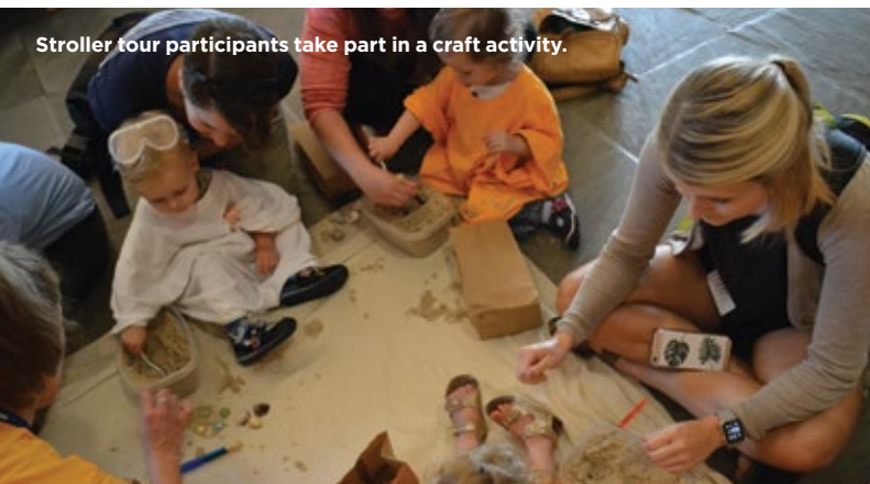
Stroller tour participants take part in a craft activity.

Our summer camp programs this year saw an increase in numbers: 85 participants compared to 53 in 2016. The most popular programs were Jurassic Kids, for toddlers and their caregivers, and Dino Explorers, for PreK and kindergarten campers. Both camps were filled to capacity and enjoyed positive reviews from participants and their families. We credit this rise in numbers to our increased online presence in social media, online registration offerings, our use of radio and television features, and our involvement in education tabling events throughout town.