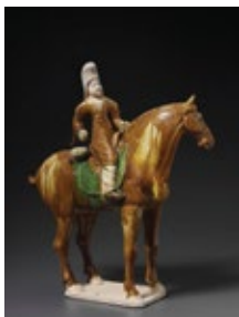
Tang Dynasty Objects