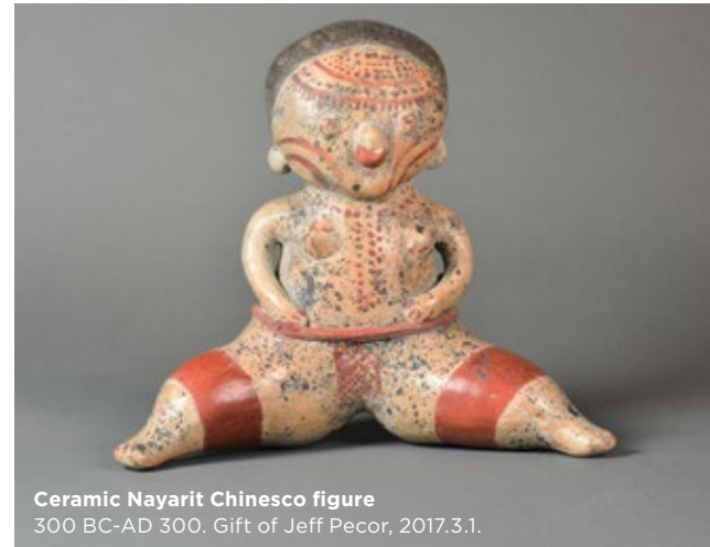
Ceramic Nayarit Chinesco figure 300 BC-AD 300. Gift of Jeff Pecor, 2017.3.1.

Ceramic Nayarit Chinesco female figure and two reproduction ceramic figures. Gift of Jeff Pecor, 2017.3.