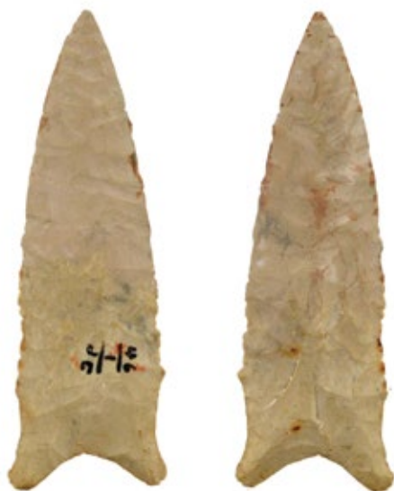
Dalton-type stone spear points ca. 8000 BC.