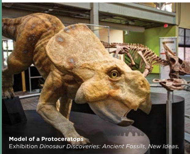
Model of a Protoceratops Exhibition Dinosaur Discoveries: Ancient Fossils, New Ideas.