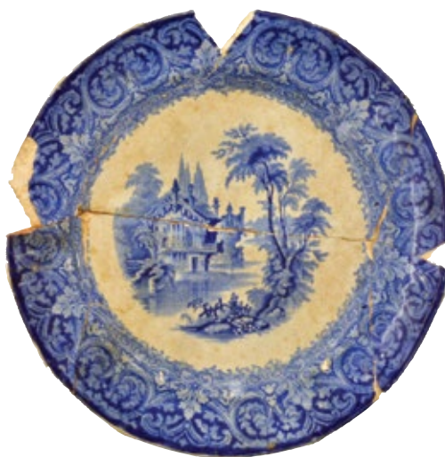
Blue Transfer Print Whiteware 19th century.

Educational and public programming with the Knoxville exhibit consisted of a teacher workshop, the 2016 Southeastern Conference on Historic Sites Archaeology, and special lectures. The teacher workshop was conducted in collaboration between the McClung Museum and the East Tennessee Historical Society and focused on the enslaved African Americans at the Blount Mansion. Teachers were introduced to the different types of research data that can be used to study slavery and how they could incorporate this into their classroom curriculum.