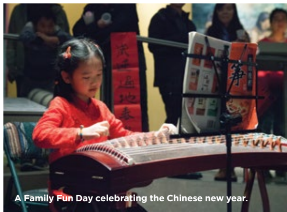
A Family Fun Day celebrating the Chinese new year.

Archaeokids: Exploring Ancient Art and Archaeology Camp, June 26–30, 2017.