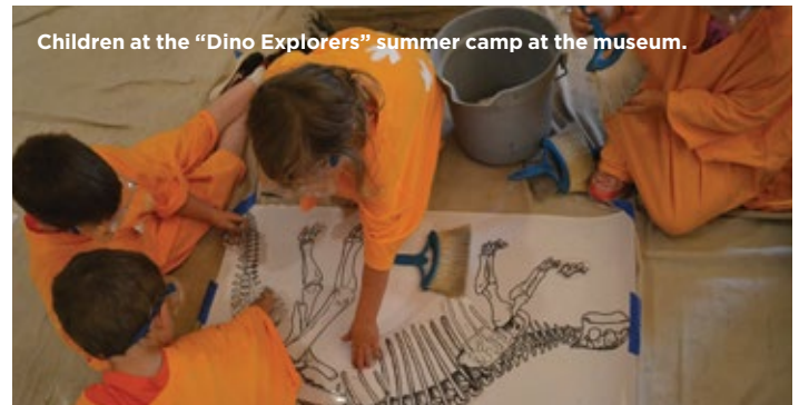
Children at the "Dino Explorers" summer camp at the museum.

Attendance to museum programs for PreK-12 students, both in the museums and outreach to schools, totaled 6,976 students, a modest increase of 0.57 percent. Most of these groups were public schools (71 percent), private (17 percent), and homeschool (4 percent), with summer daycare, afterschool, Scout groups, and other special groups attending primarily in the summer.