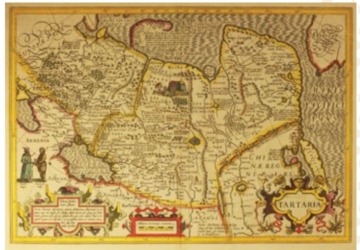
Tartaria Hand-colored copperplate engraving on paper by Jodocus Hondius, France, 1606, Gift of Donald and Tina Sheff, 2016.6.4.

This academic year, on eight Sunday afternoons, 40 to 50 Chancellor's Honors students encountered 150-year-old handwritten military records full of abbreviations, misspellings, blurry ink, illegible penmanship, specialized terminology, and antiquated language usage. From that flawed raw material, the students are producing typed, legible, searchable historic records which have not been studied since they were archived more than a century ago.