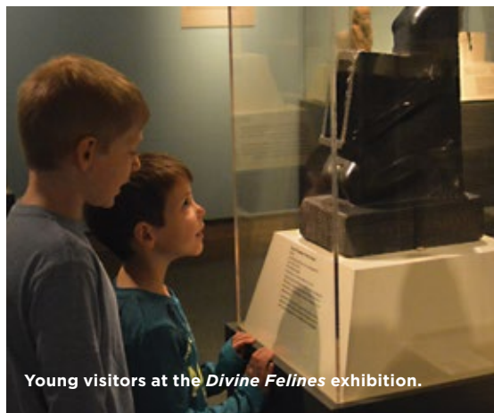
Young visitors at the Divine Felines exhibition.