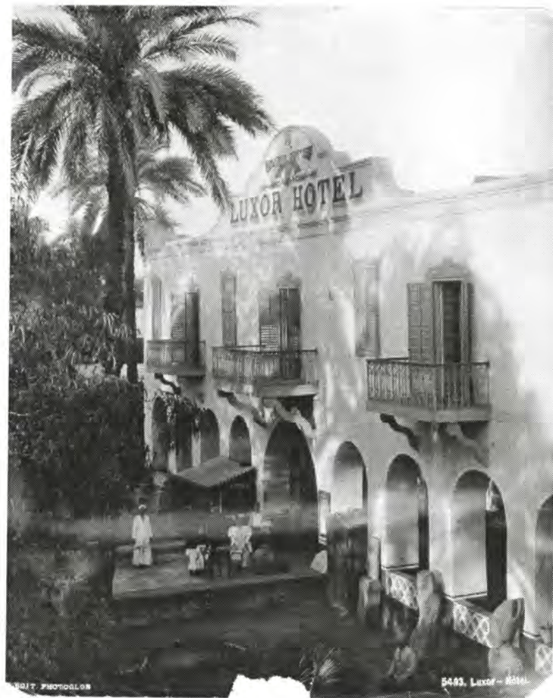
The Luxor Hotel, Luxor, Egypt. 19th Century. Collection of the Frank H. McClung Museum, The University of Tennessee, Knoxville.