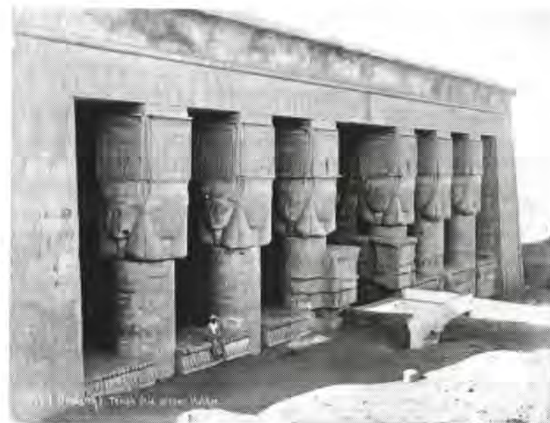
The Temple of Hathor at Dendera, Late Ptolemaic-Roman Period. 19th Century. Collection of Frank H. McClung Museum, The University of Tennessee, Knoxville.