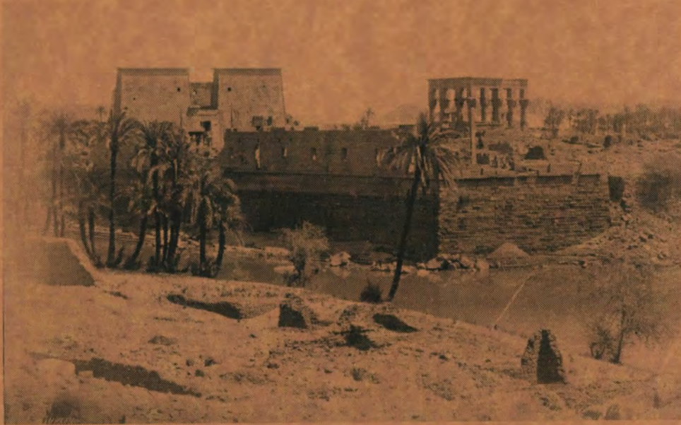
The Temple of Isis at Philae. 19th Century.