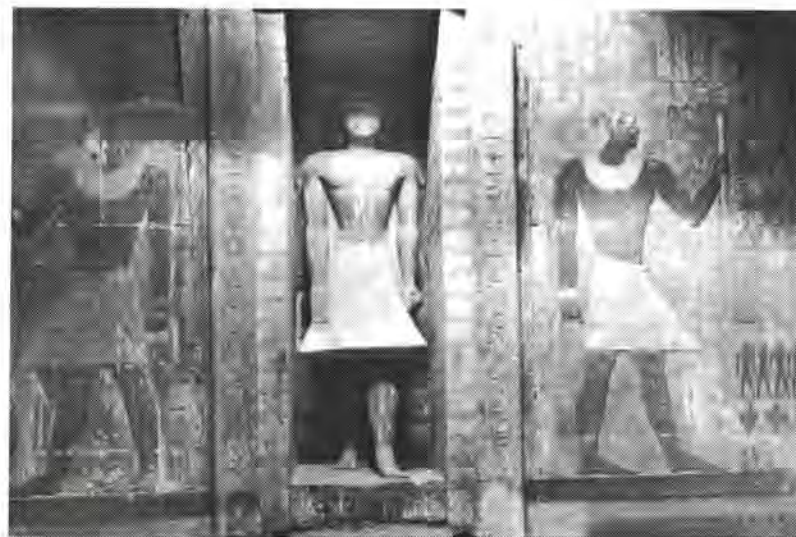
The Tomb of Mereruka, Dynasty VI, at Saqqara. Collection of the Frank H. McClung Museum, The University of Tennessee.